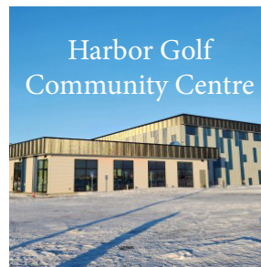
Harbor Golf Community Centre