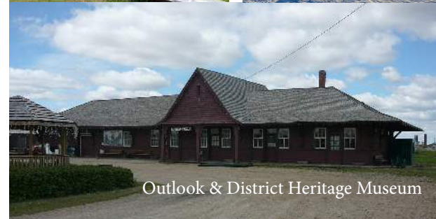
Outlook & District Heritage Museum